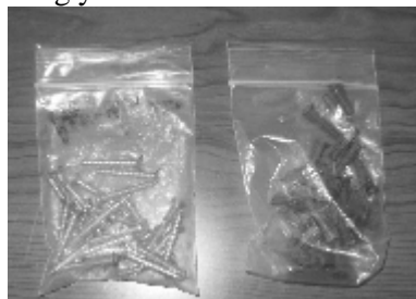
screws & anchors